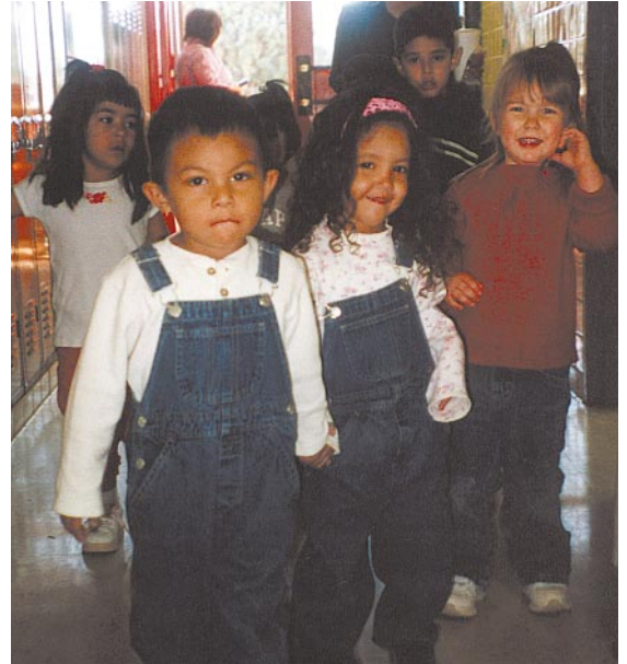
Parents of Catholic school students work long hours in the fields and on the ranches to provide a faith-based education for their children.

Yet these dioceses are rich in faith. In August 2002, Amarillo sponsored a Eucharistic Congress that drew 6,000 people—remarkable considering that the total Catholic population is under 50,000. Later that year, Lubbock demonstrated its ties to the universal Church by exhibiting medieval frescoes from the Vatican Museum for the edification of Catholics and non-Catholics alike. The Holy Spirit is blowing in that Texas wing. ■