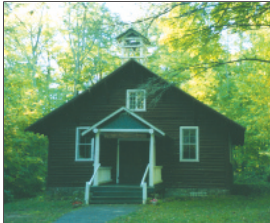
Our Lady of the Lake Chapel, Victory Heights, WI.

Catholic colleges could offer catechist formation, but there are none in the diocese. Regional workshops by the diocesan office fill the gap.