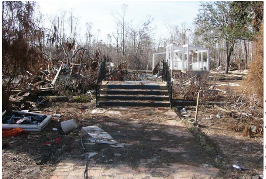
St. Joseph Church (Bay St. Louis, Mississippi) before and after Hurricane Katrina.