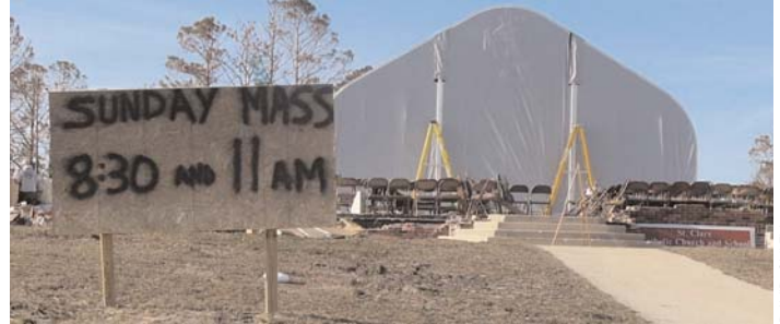
St. Clare's Parish (Waveland, Mississippi)